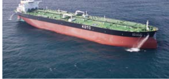
Vessel Name: DAR SALWA Delivery Date: 2010 Deadweight: 319,761 Type: Crude Carrier