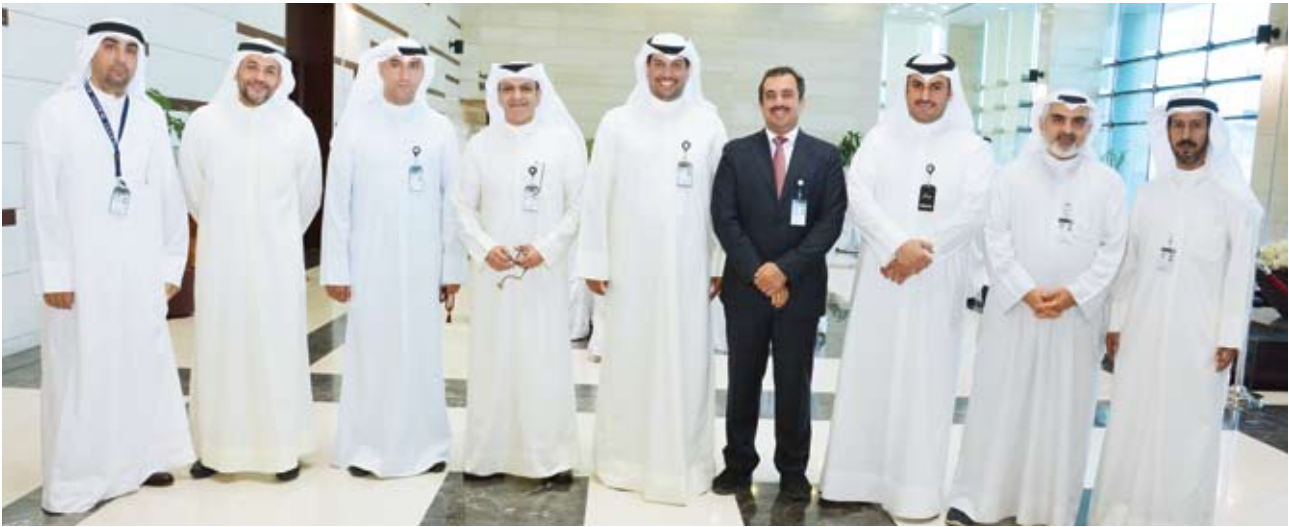
■ A number of managers and teams leader participating in the activities of "Think - K"