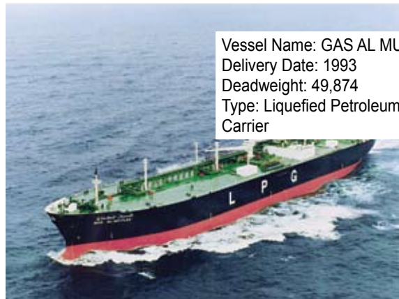
Vessel Name: GAS AL MUTLAA Delivery Date: 1993 Deadweight: 49,874 Type: Liquefied Petroleum Gas Carrier