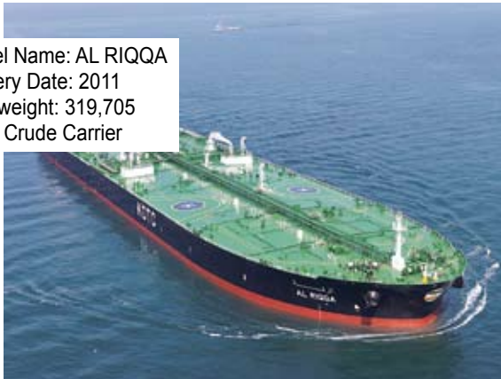
Vessel Name: AL RIQQA Delivery Date: 2011 Deadweight: 319,705 Type: Crude Carrier