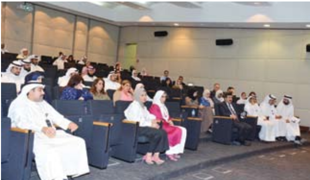
■ Participants in the lecture