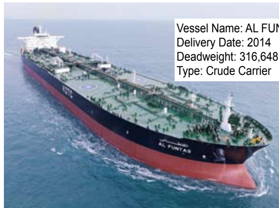
Vessel Name: AL FUNTAS Delivery Date: 2014 Deadweight: 316,648 Type: Crude Carrier