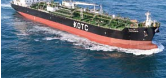
Vessel Name: MUTRIBA Delivery Date: 2014 Deadweight: 46,327 Type: Product Carrier