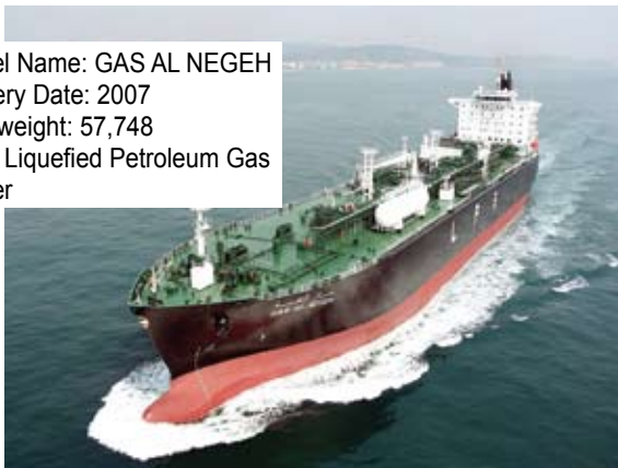
Vessel Name: GAS AL NEGEH Delivery Date: 2007 Deadweight: 57,748 Type: Liquefied Petroleum Gas Carrier