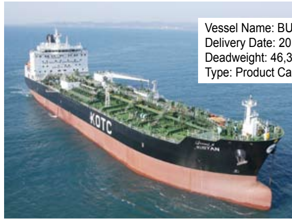
Vessel Name: BUBYAN Delivery Date: 2014 Deadweight: 46,320 Type: Product Carrier