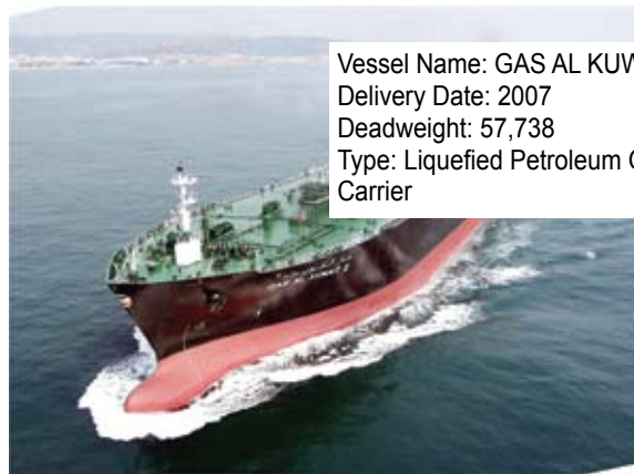
Vessel Name: GAS AL KUWAIT II Delivery Date: 2007 Deadweight: 57,738 Type: Liquefied Petroleum Gas Carrier