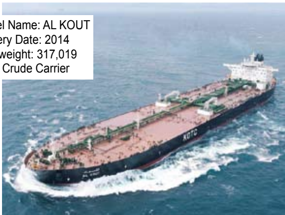
Vessel Name: AL KOUT Delivery Date: 2014 Deadweight: 317,019 Type: Crude Carrier