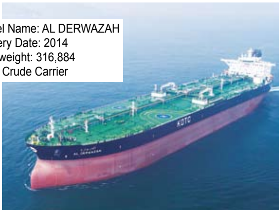
Vessel Name: AL DERWAZAH Delivery Date: 2014 Deadweight: 316,884 Type: Crude Carrier