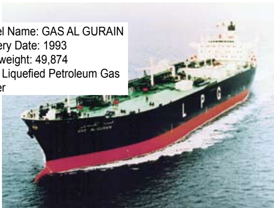
Vessel Name: GAS AL GURAIN Delivery Date: 1993 Deadweight: 49,874 Type: Liquefied Petroleum Gas Carrier