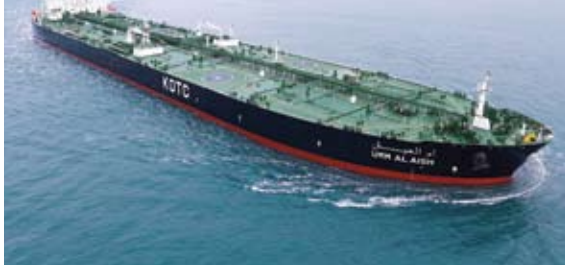
Vessel Name: UMM AL AISH Delivery Date: 2011 Deadweight: 319,634 Type: Crude Carrier