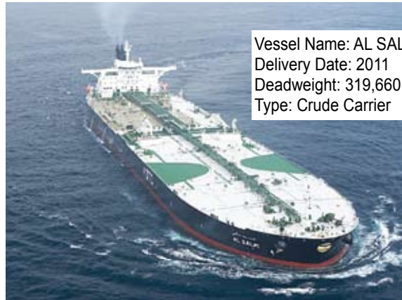
Vessel Name: AL SALMI Delivery Date: 2011 Deadweight: 319,660 Type: Crude Carrier