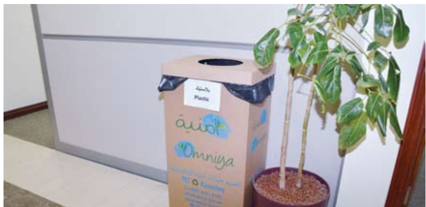
■ A plastic collection box distributed in the company's premises

In this context, the Group of Quality Management, Health, Safety, Security, Environment and Risk Management signed a cooperation protocol with Omniya Plastic Bottle Recycling as they distributed a number of boxes to collect the plastic materials used by employees in the Head Office to be recycled in a safe manner. Omniya PET Recycling Company