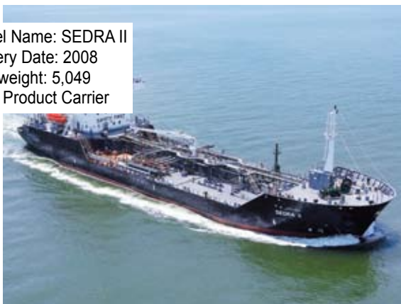
Vessel Name: SEDRA II Delivery Date: 2008 Deadweight: 5,049 Type: Product Carrier