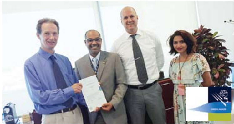
■ A commemorative shot during the receipt of the certificate of "Green Award"

For 18 consecutive years, KOTC maintained its compliance with the Green Award Foundation standards. The certification procedure consists of an office audit, conducted every 3 years and an annual audit of each individual ship applying for certification. Among many