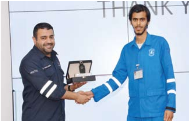
■ A student being honored