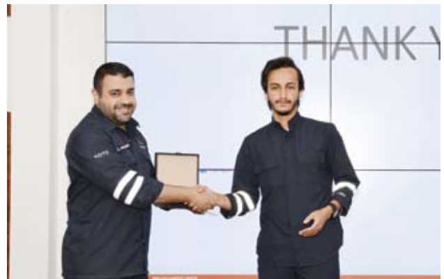
■ And another