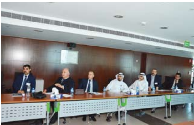
■ Participants at the presentation