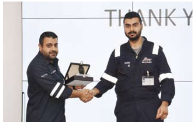
■ Another honored student