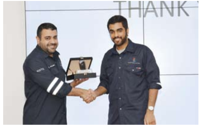
■ A student receiving a shield