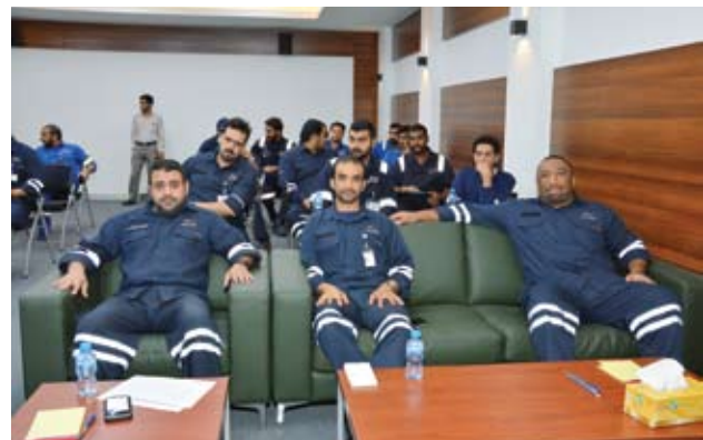
■ Part of attendance