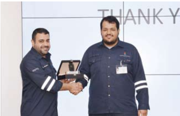
■ Honoring a student