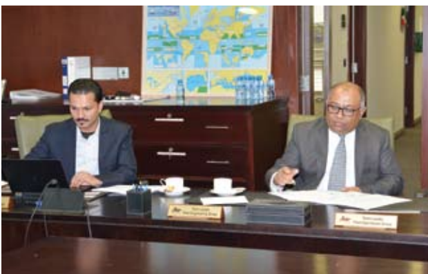
■ Alfa Laval and ASRY representatives at the meeting