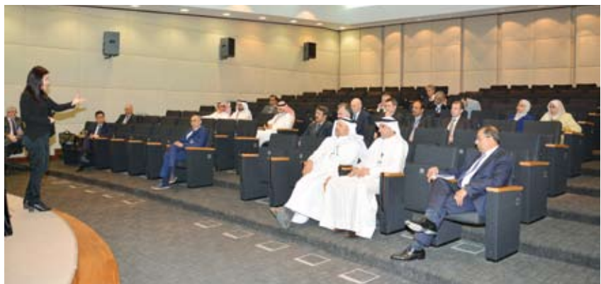
■ DNV GL representative at the presentation