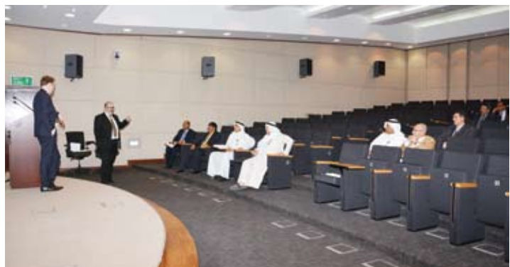
■ At the presentation

A delegation from Hempel Paints Co. paid a visit to KOTC and gave a presentation about tankers' coating technology. A number of Fleet Engineering, Fleet Operations and New Fleet Building Projects Groups attended the presentation. The attendance was briefed about the latest in tankers' paints and painting. Ideas and cooperation between KOTC and Hempel paints Co. through KOTC new tankers building projects were exchanged.