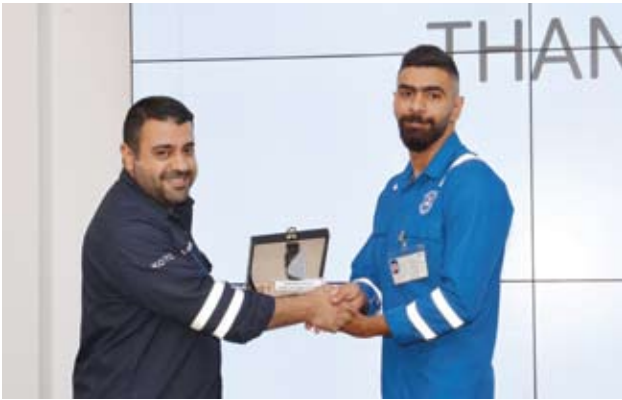
■ Another student receiving a shield