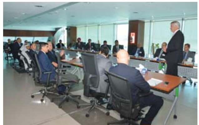
■ A speaker from DNV GL