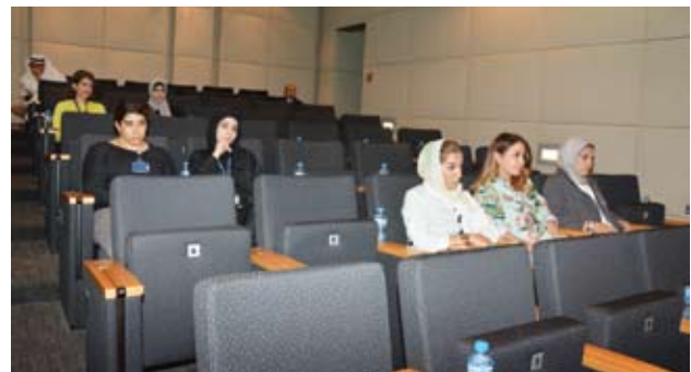
■ Attendance at the presentation