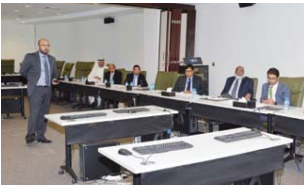
■ DNV GL representative speaks about energy management system

standards, such as ISO 9001 or ISO 14001, are also used. This makes it easier for KOTC to integrate energy management into its overall efforts to improve energy and environmental management. ISO 50001 provides a framework of requirements for KOTC to develop a policy for more efficient use of energy, fix targets to meet the policy, use data to understand better and make decisions about