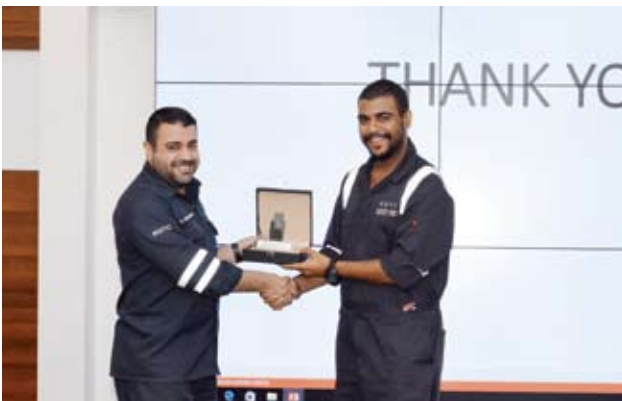
■ A student receiving a shield