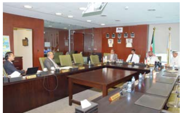
■ KOTC meeting with Alfa Laval and ASRY representatives