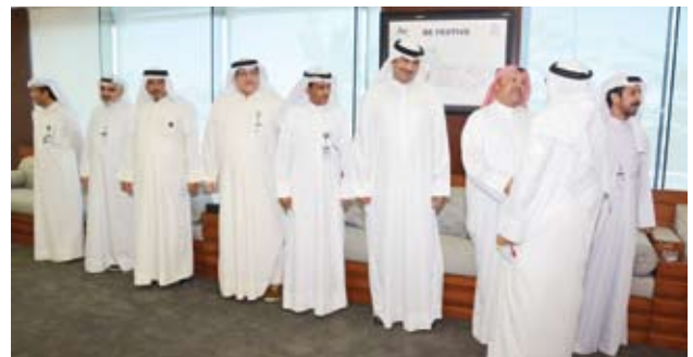
■ Managers receiving congratulations