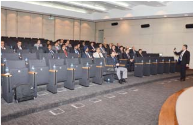
■ A speaker from DNV GL at the presentation