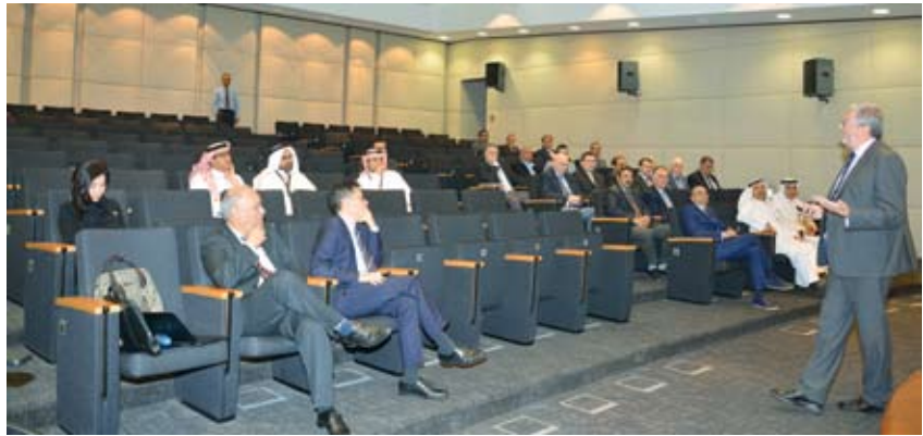
■ At the presentation

procured a software (Eco-Insight) which will also cover us for EU Monitoring, Reporting and Verification (MRV) management. From the 1st of January 2018, the EU-MRV regulation requires ship owners and operators to annually monitor, report and verify CO2 emissions for vessels calling at EU port. Reference regulation has been issued by the European Parliament on 29 April 2015. KOTC has already prepared and submitted its plans to the verifiers which will be further submitted to EU authorities. As per the regulation, all vessels have to commence emission data collection from 1st Jan 2018. The company is ready to meet the deadlines. Additionally, this software is expected to cover the forthcoming IMO DCS